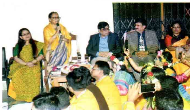
The Chief Guest renowned Novelist Selina Hossain addressing as the Chief Guest of the programme