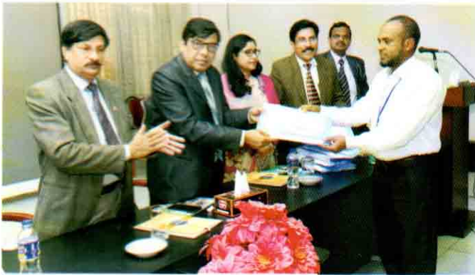
Certificate Awarding and Closing Ceremony of 57 th Information and Communication Technology Training Course for Secondary Level Teachers