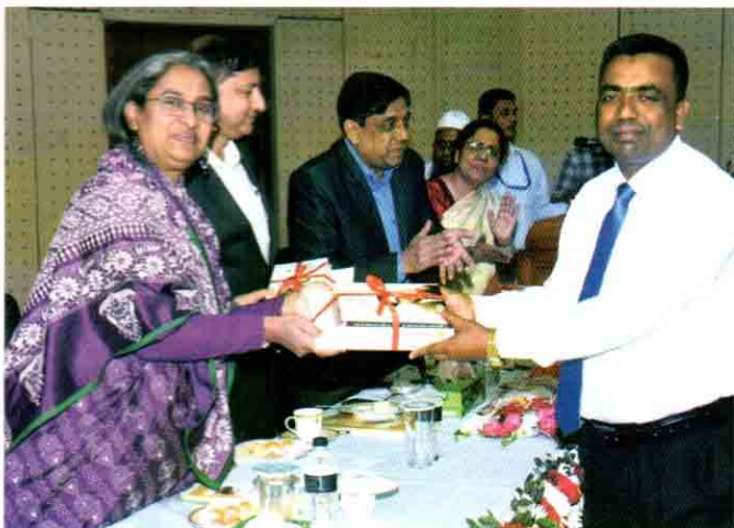
One of the participants of 158 th FTC is receiving training materials from the Chief Guest

The Hon'ble Education Minister delivered her speech as the Chief Guest and distributed Training Materials to the trainees of the course. She urged the newly recruited officers to be alert, and motivate students to prevent terrorism and corruption. She said that education is the backbone of a nation and teachers are the key role players in that aspect. In his speech as Special Guest of the program, Honourable Deputy Minister, Ministry of Education, Mr. Mohibul Hasan Chowdhury MP said that under the dynamic leadership of Shaikh Hasina, Hon'ble Prime Minister of Bangladesh has become the role model of development to the world community. Our Economy is marching on and we have some remarkable progress in the field of Education. Still we have many things to do for the sustainable educational