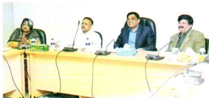
Seminar on Draft Research Report Presentation of FY 2019-2020

In this quarter, on 09-11 March, 2020 Research and Documentation Division has completed the Draft Research Report Presentation Seminar of NAEM Research work FY 2019- 2020.