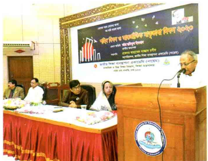
Eminent Educationist National Professor Dr. Rafiqul Islam delivering his speech as the Chief Guest of the program on Shahid Dibosh and International Mother Language Day