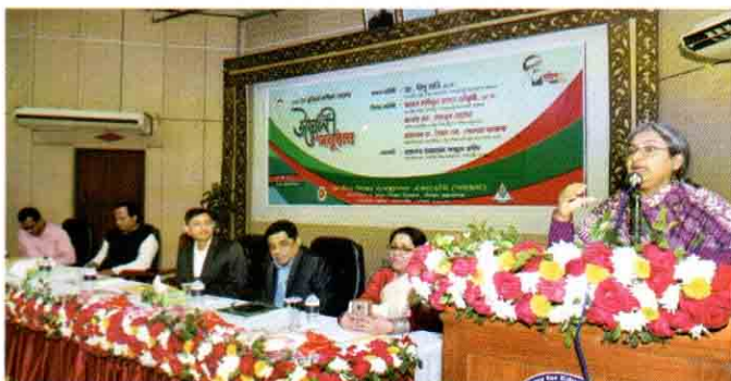
Hon'ble Education Minister, Dr. Dipu Moni MP, addressing at the Opening Ceremony of 158 th Foundation Training Course (FTC)