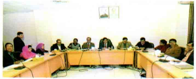
A workshop on Content Development of Educational Administration and Management Training Course