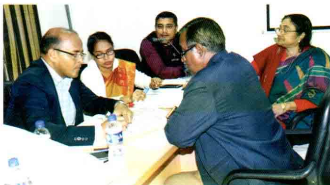
Workshops on Sustainable Development Goals (SDGs)