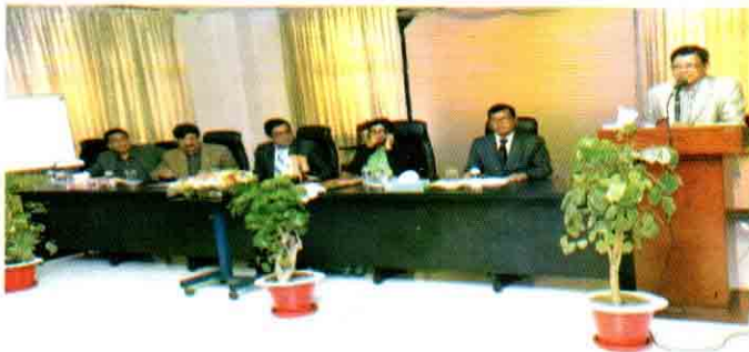
A Workshop on Innovation Idea Generation