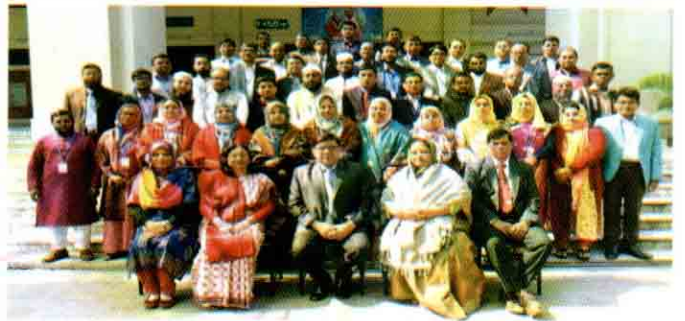
Participants of First Library Planning and Management (LPM) Training Course