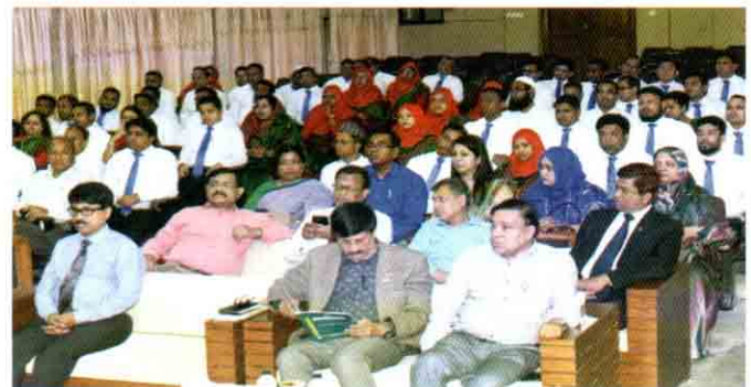
Respected audience and participants of 158 th FTC in the opening session