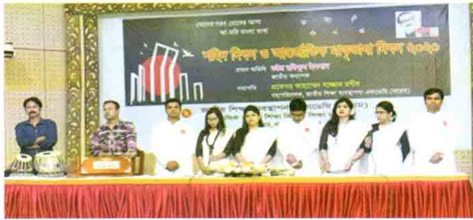
The participants of 157 th FTC attending cultural events on the occasion of Shahid Dibas and International Mother Language Day