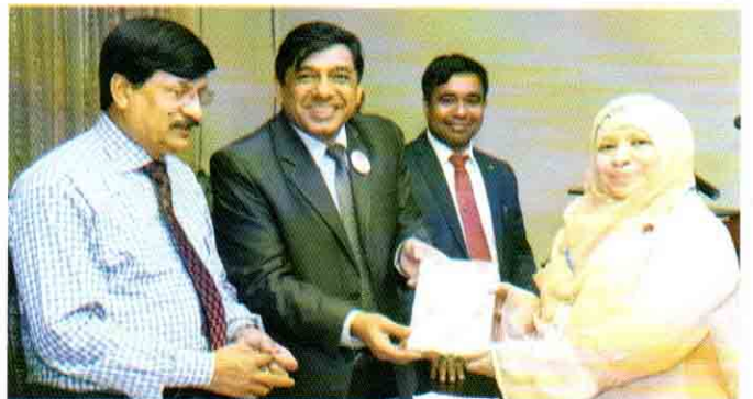
Certificate Awarding and Closing Ceremony of 67 th Communicative English course (CEC) for Secondary Level English teachers