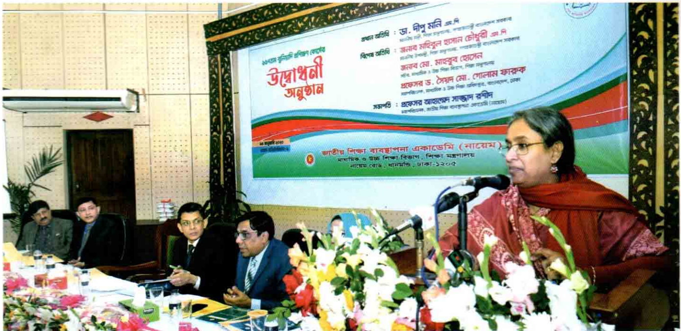
Hon'ble Education Minister, Dr. Dipu Moni MP, addressing at the Opening Ceremony of 157 th Foundation Training Course (FTC)