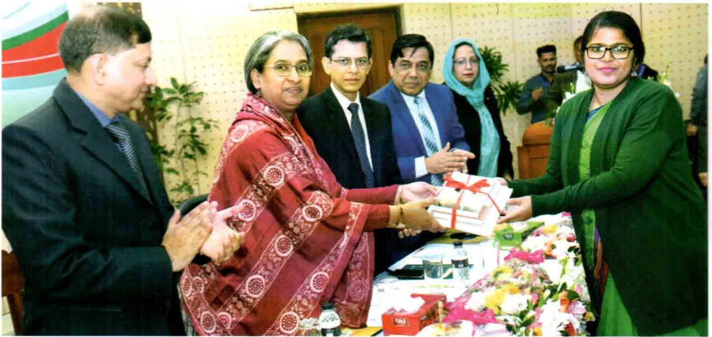
One of the participants of 157 th FTC is receiving training materials from the Chief Guest

The Hon'ble Secretary said that the officers and teachers should specify their targeted goals to become a global standard professional as early as possible for nursing the students cordially to prevent terrorism and corruption and to prevent the abuse of religion. The Hon'ble Director General of DSHE welcome the participants to the Foundation Training Course in his speech for their professional development to make them more efficient as officers in their respective field and contribute to the overall educational progress in the country through